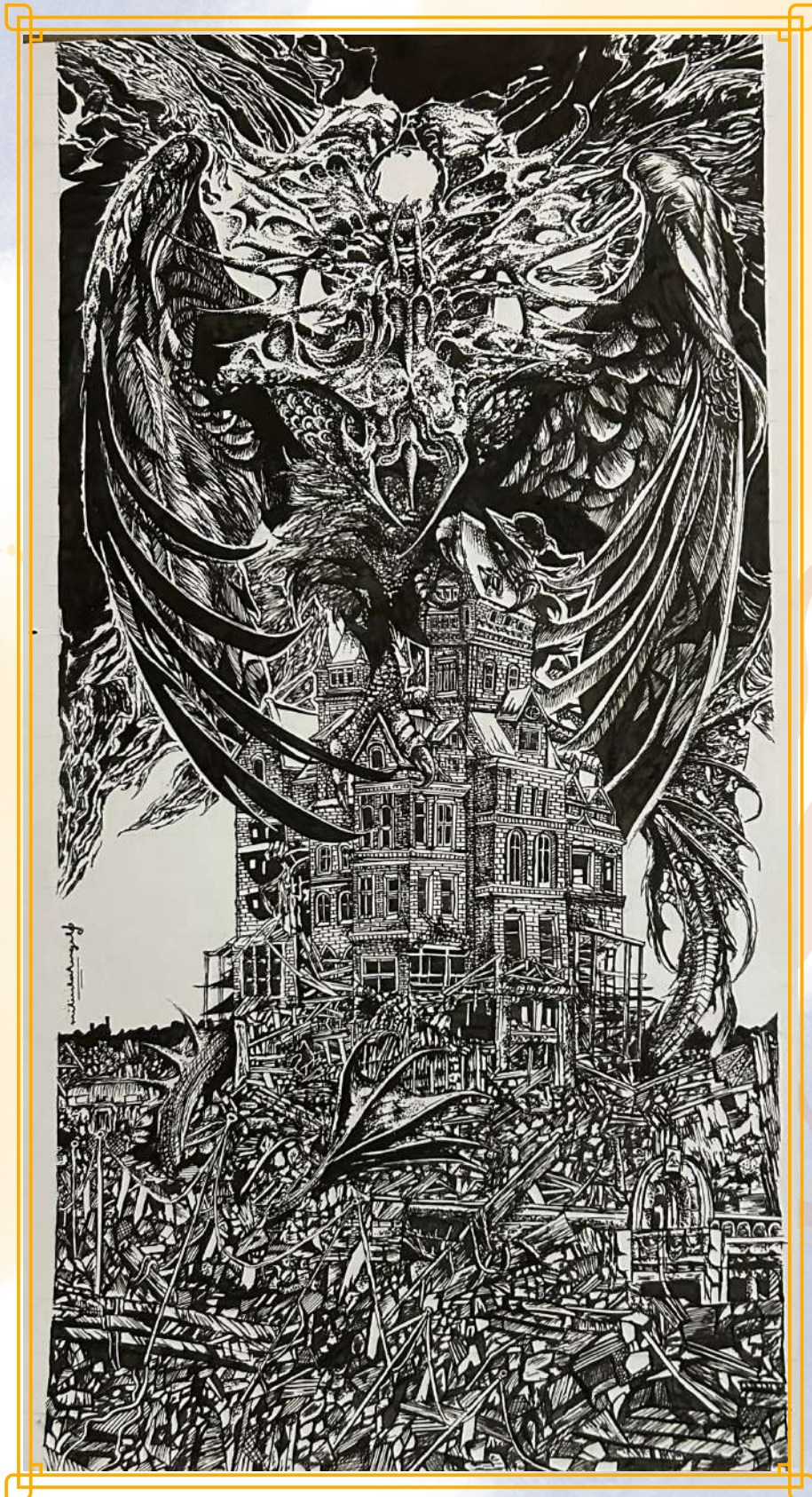
Milinda Angel (XI-O)