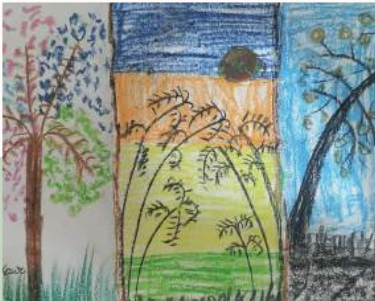
Mehreen Kaur (I-S)