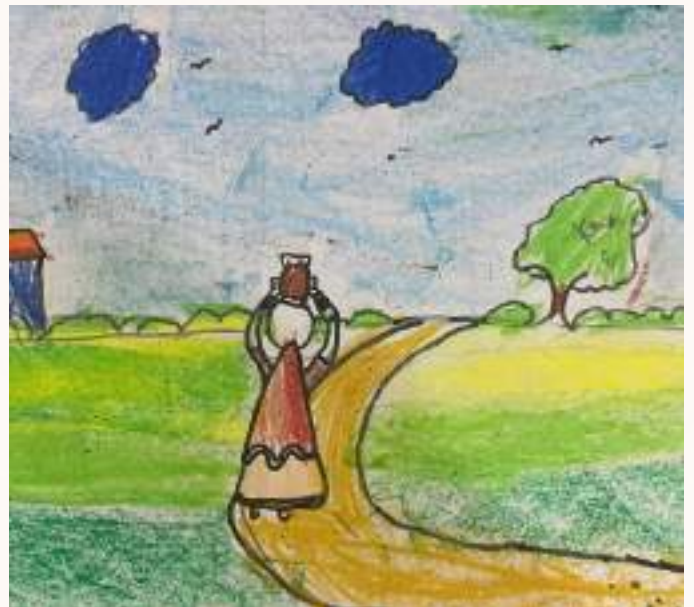
Nehmat Kaur (I-N)