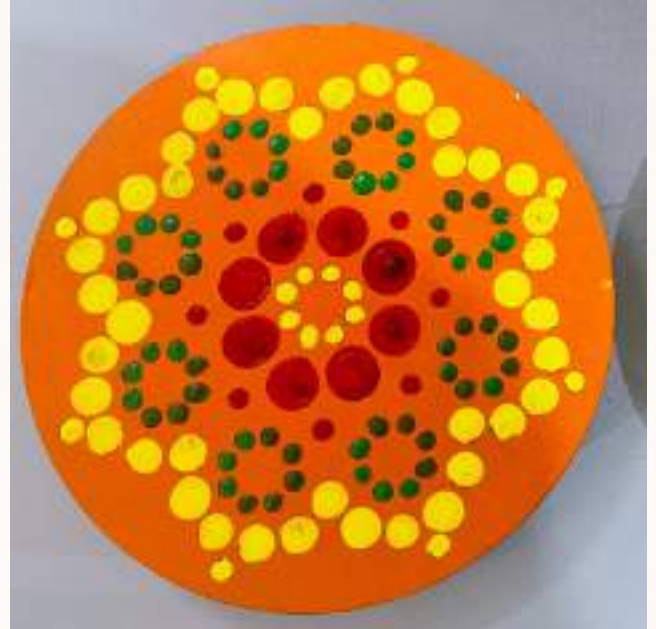
Samayra Sethi (VII-T)