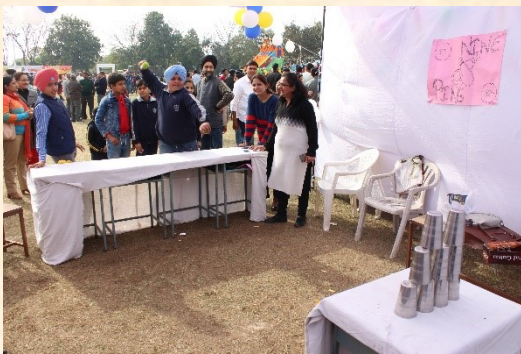
Going For It!