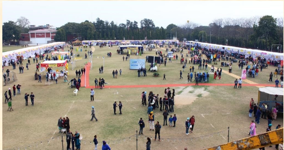
Bird's Eye View of the YPS Fete