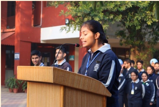
The Last Address at YPS