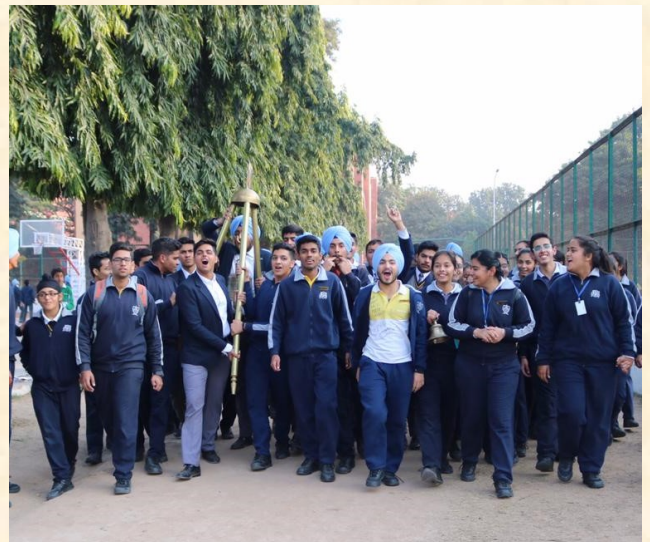
The Tradition of the School Bell