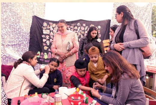
The Joy of Getting Painted