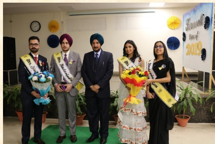
Mr. and Ms. Yadavindrians