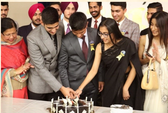
The Cake-cutting Ceremony

As they walked out of the gates of YPS, they appeared to be grappling with strong emotions, of anticipation and the excitement of what lay ahead. They felt the agony of leaving their carefree days behind and ventured into the great, big world. It was indeed, an evening to be cherished. We wish them best of luck for their future lives and decisions, and take this opportunity to remind them that they not only have an institution, but also a family to rely on. AU REVOIR!