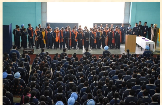
"Our ancestors gave us a glorious past..... We need to create the future..... This Republic Day..... lead the change and become a real INDIAN....."

26 th January holds a very significant place in the heart of each Indian. The annual Republic Day celebrations took place on 25 th January, 2019 with great zeal and patriotic fervour. The celebrations began with a speech delivered by our school Head Boy and Head Girl. These wise words left a deep impact on the students. Speeches and poems in different languages were followed by mesmerizing patriotic songs sung by our school choir. At last, the assembly was addressed by the Director who emphasized that everyone should read the preamble. Students took pride in glorifying and celebrating the 70 th Republic Day. Each student went out of the Gym Hall with a spirit of unity and brotherhood.