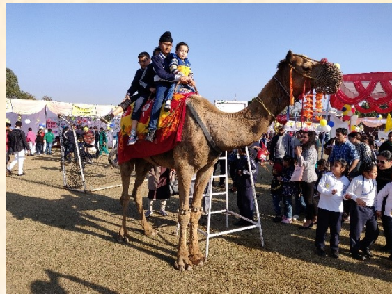
The Ship of the Desert in the Field of YPS