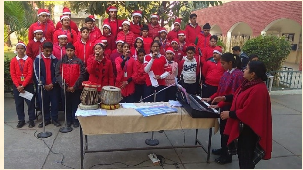
From door to door, from heart to heart Christmas binds us together so that we are never ever torn apart!