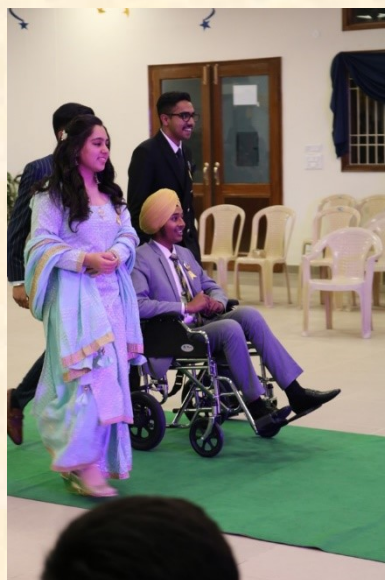
The Ramp Walk