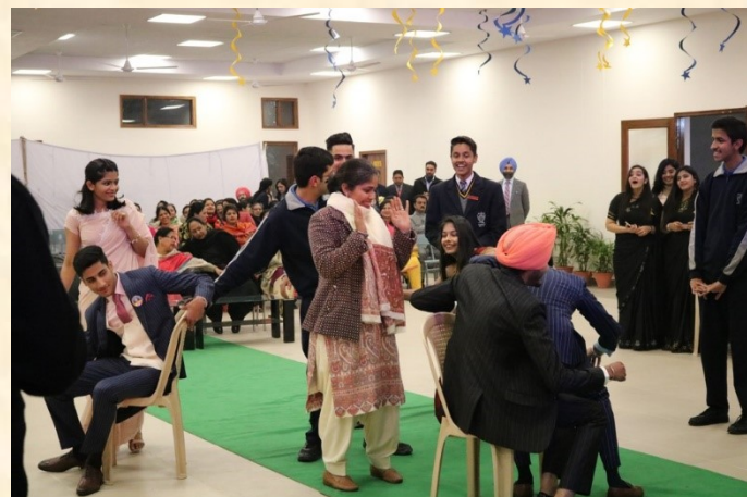
The Musical Chairs