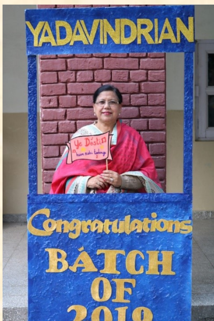
The DHM at the Photobooth