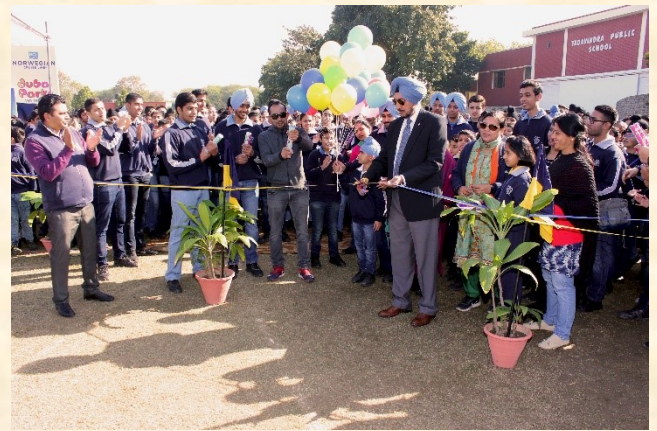
The Inauguration of "Food, Games, Music and Masti"