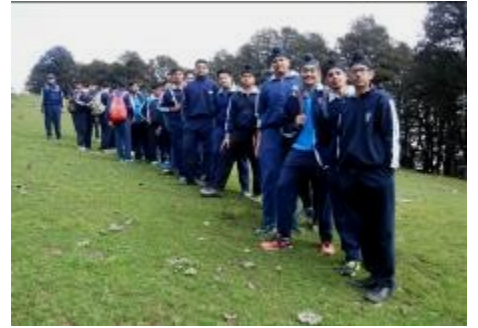
STOPPING BY THE WOODS!