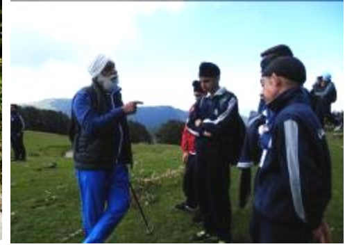
LEARNING TO PITCH A TENT!