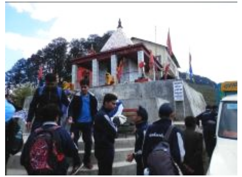
AT THE HILL PEAK!