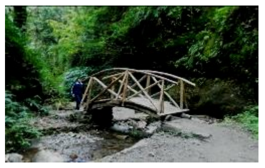
CROSSING THE RICKETY BRIDGE!