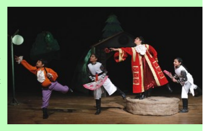
The Knight slays the Dragon.