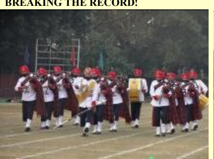
MARCHING TO THE BEATS!