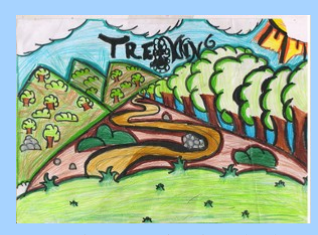
Trekking all the way! by Rishabh (IV-T)