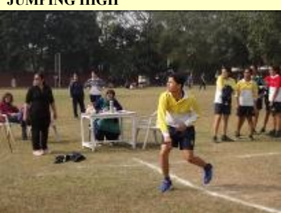
BREAKING THE RECORD!