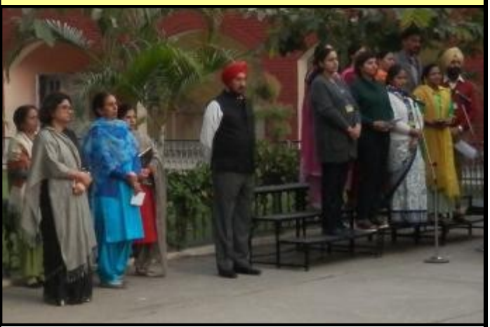
CHILDREN'S DAY CELEBRATION