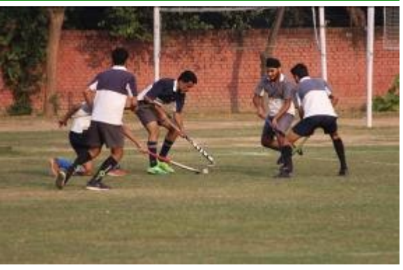
THE PERFECT TACKLE