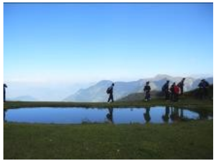
MILES TO GO