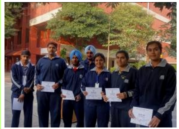
THE INDIVIDUAL WINNERS