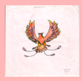
The Phoenix by Akshit (II-S)