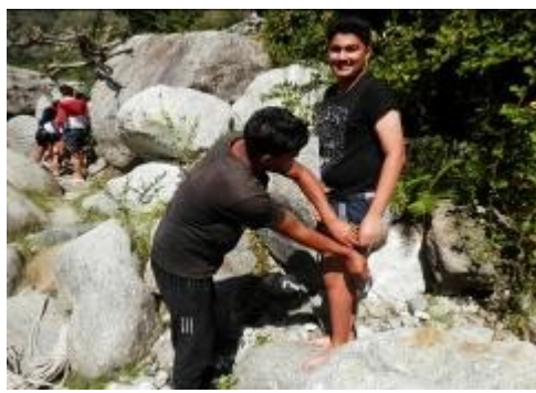
READY TO CLIMB THE MOUNTAIN