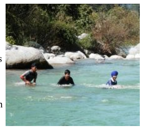
CHALLENGING THE RIVER!

Trekking is everybody's favourite Activity of the year. What can be better than a journey to the mountains in the arms of nature, being in cool weather and sipping a cup of tea with friends? No matter how many times we go, trekking is an adventure which never fails to teach us one thing or the other.