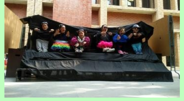
...and they became Midgets on Children's Day!!!