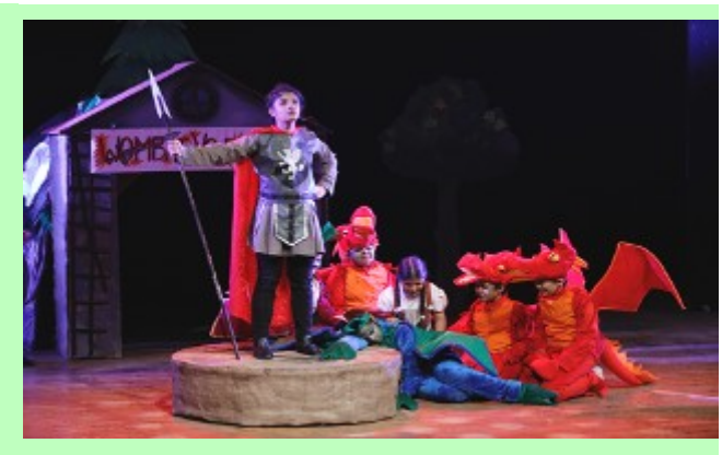
Off we go in search of the Dragon!

This year's annual production of YPS Junior Wing 'Hide and Seek' was the story of two unlikely friends - Hide, a friendly dragon and Seek, an inquisitive and adventurous girl. The play unfolded to tell us how their trust and friendship broke stereotypes and rose above all prejudices. The play was about the society's discovery that it was high time we let go of our misplaced beliefs of trusting appearances and legends blindly. And, if we manage to do that, we could live in harmony with nature and all its creatures.