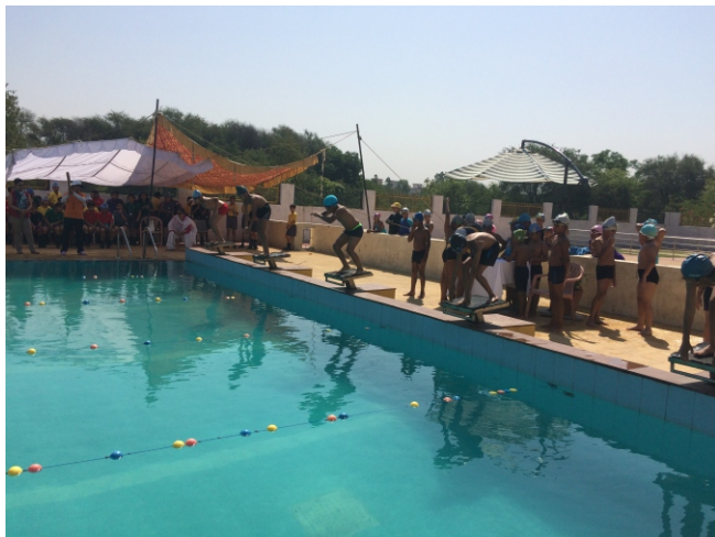
Ready to Dive

Swimming for the students of IV and V began on 18th April. It culminated in a Swimming Meet on 20th May.