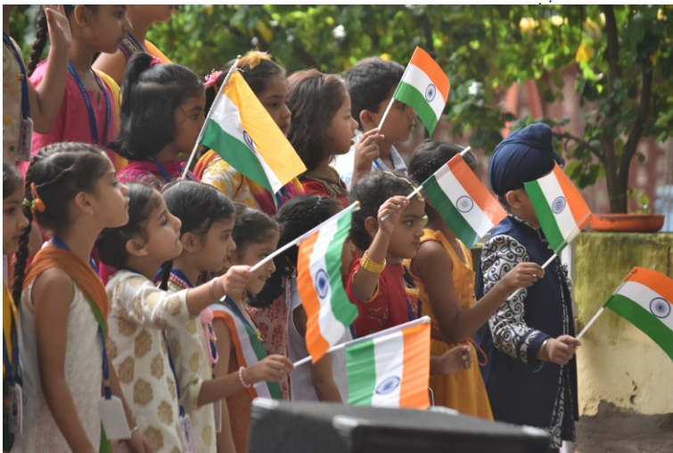
and high we lift the tri-colour with pride