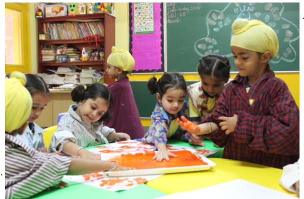
soaking into the independence spirit