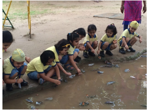
ek chotti kashti....