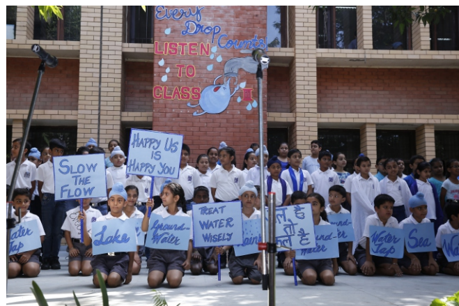
Every Drop Counts

Thematic assembly on "Every Drop Counts" was presented by Class III on 9th August. The message it spread laid emphasis on water conservation. A Special Assembly "Celebrating India- Azadi 70" was held on 12th August. Class I danced on a medley of songs and the Indian music choir gave an exhilarating percussion performance on the song "Jai Ho" using instruments that were made from common things that produce sound like pans, pots, buckets, sticks and pebbles in bottles along with tabla, congo and drum.