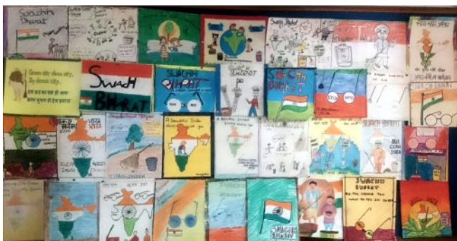
▲ Swachh Bharat message board

The clean and sanitized India campaign has been launched in schools in order to spread awareness regarding the importance of hygiene and cleanliness. On February 1, 2016, the students and teachers of YPS pledged to work hand in hand to make the Swachh Bharat Mission a success.