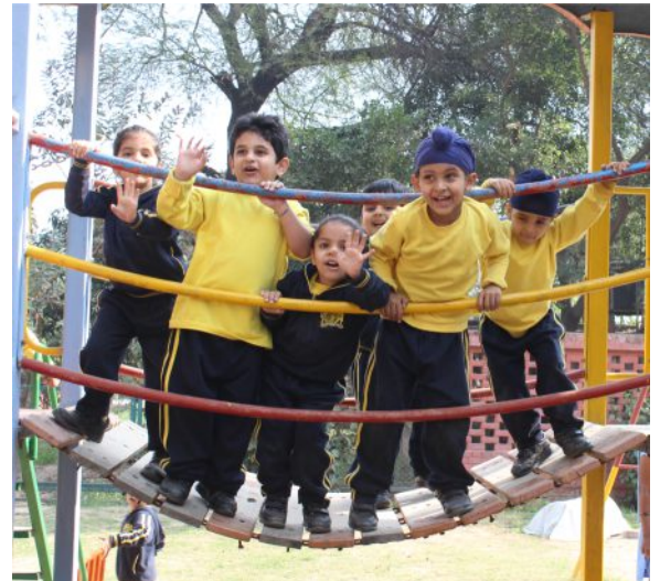
▲ Hi There!