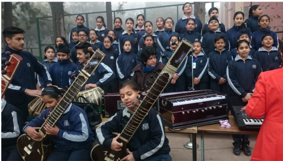
▲ Republic Day Celebrations