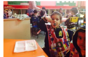
▲ Meal Time!