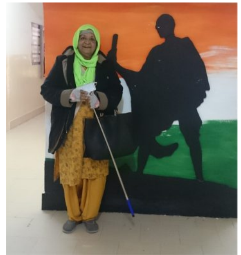
▲ The Mahatma and the Legend