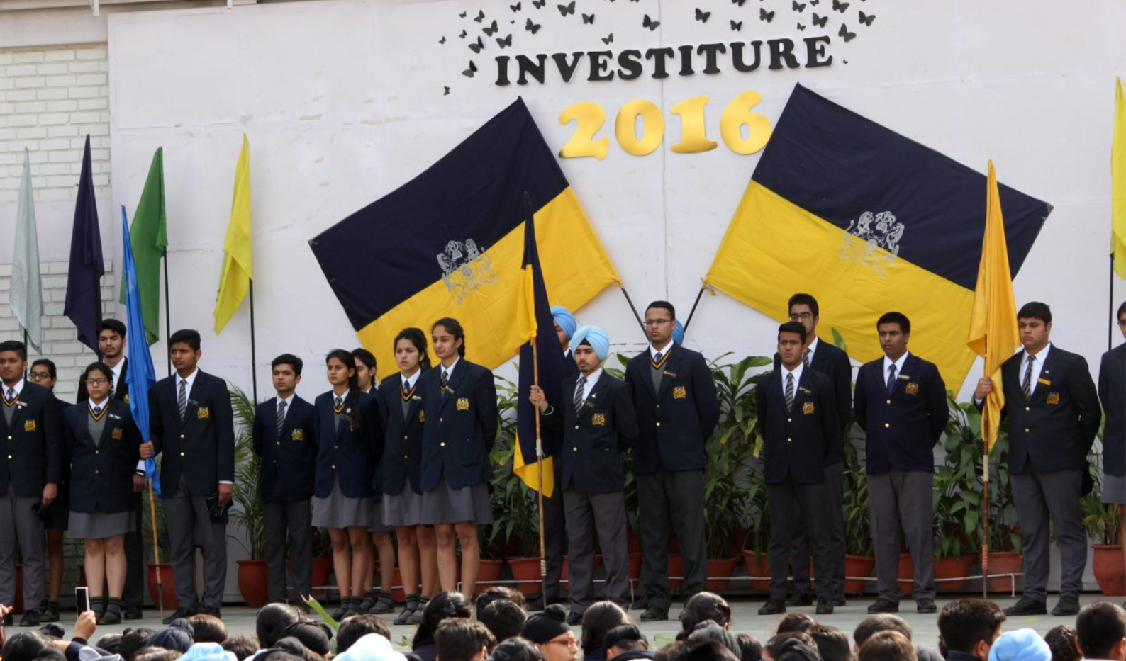
▲ The new Students' Council