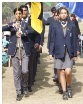
▲ The old gives way to the new