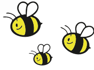
▼ Basant Panchmi