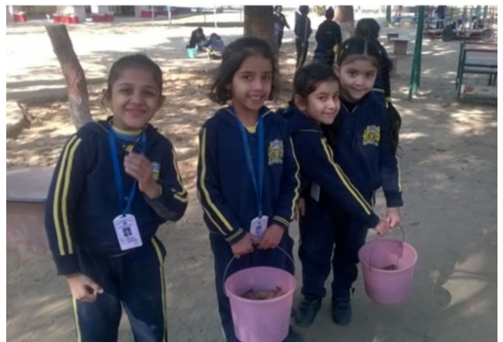
▲ UKG STUDENTS cleaned the school campus on February 18, 2016