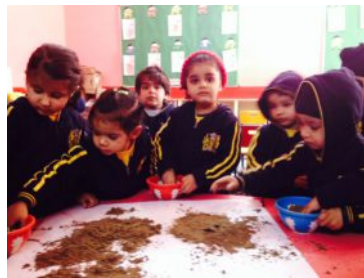
▲ Mud is FUN