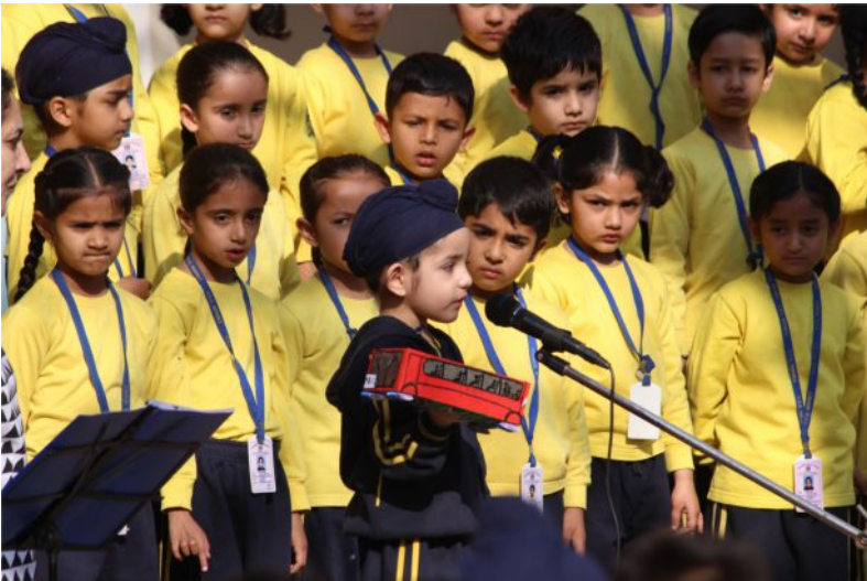
▲ Show and Tell