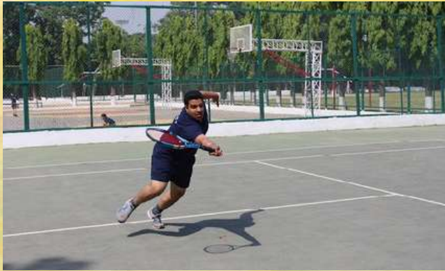
"Patialian in swing"