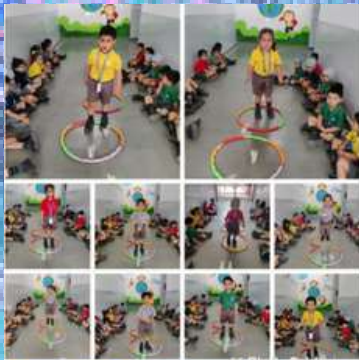
HOOPING IN THE SHAPES