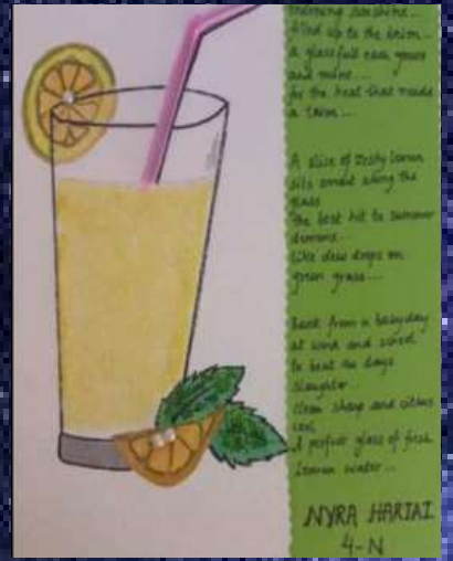
NYRA HARIJAL 4-N