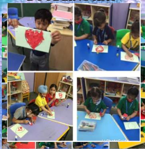
THANK YOU DIDIS!