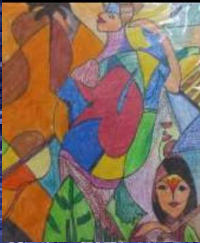
Navrose IV T