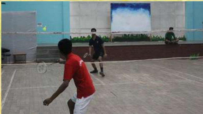
Tagore v/s Patiala