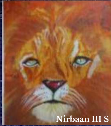
Nirbaan III S