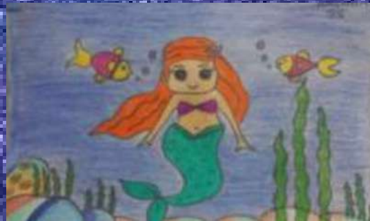
Aashna III S