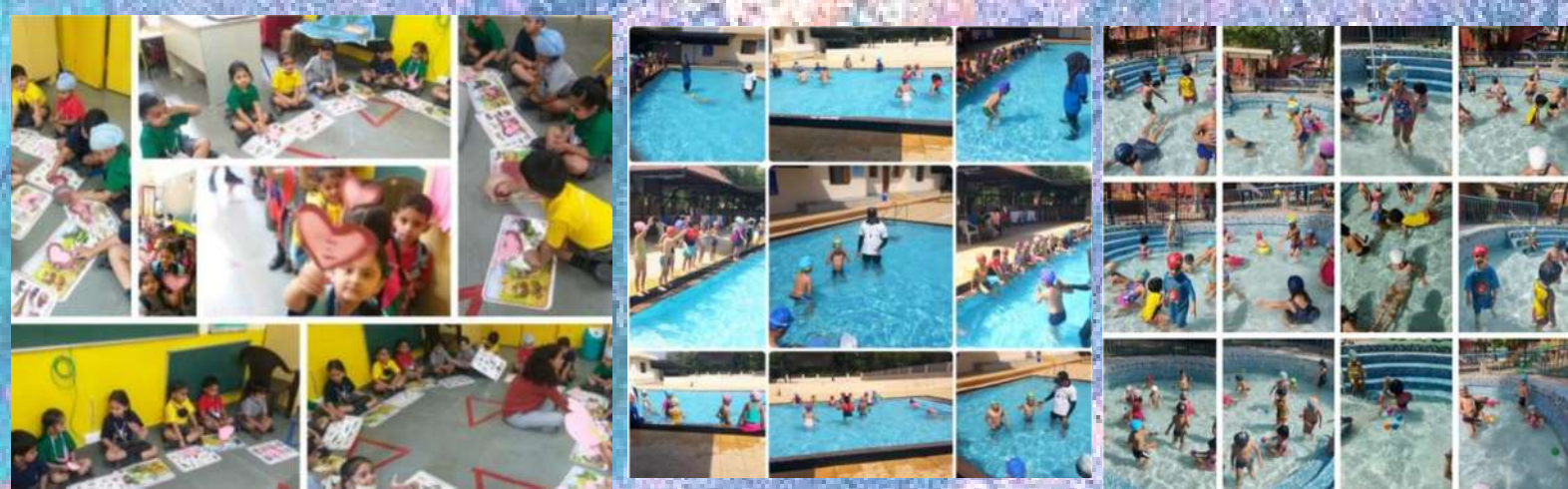
SPLISH AND SPLASH