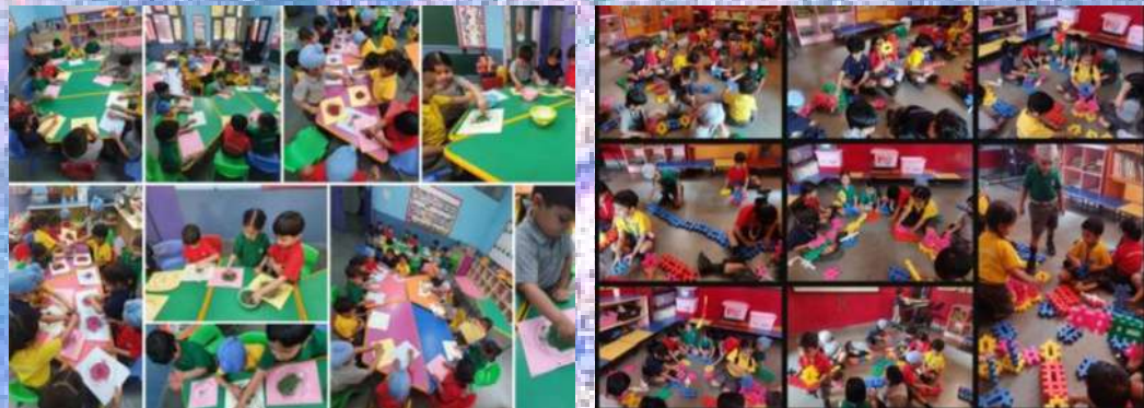
THE SENSORY PERCEPTION